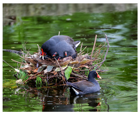
Family Time Digital Open