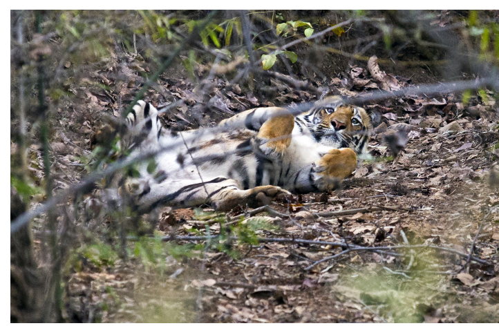
Tiger in the Bush Digital Set Subject Credit Des LYE