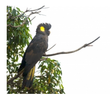
Black Cocky Accepted Bernard Graves