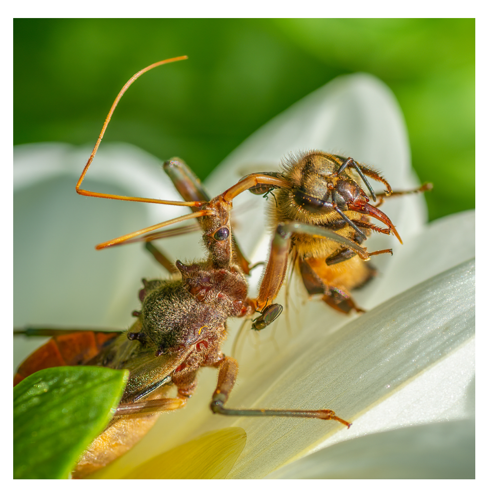
Headache with no Cure Image of Night (ION) Ted Dimitropoulos