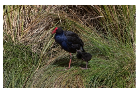
Purple Swamphen And Young