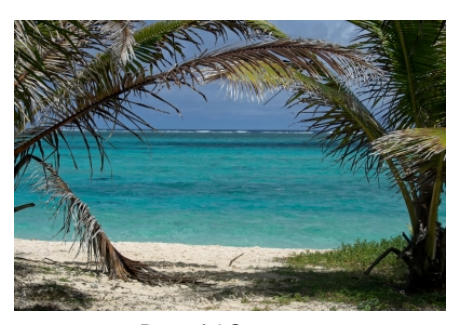
Peaceful Seascape Accepted Peter Botterill