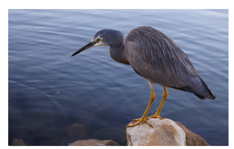
Where is my food tonight? Digital Set Subject