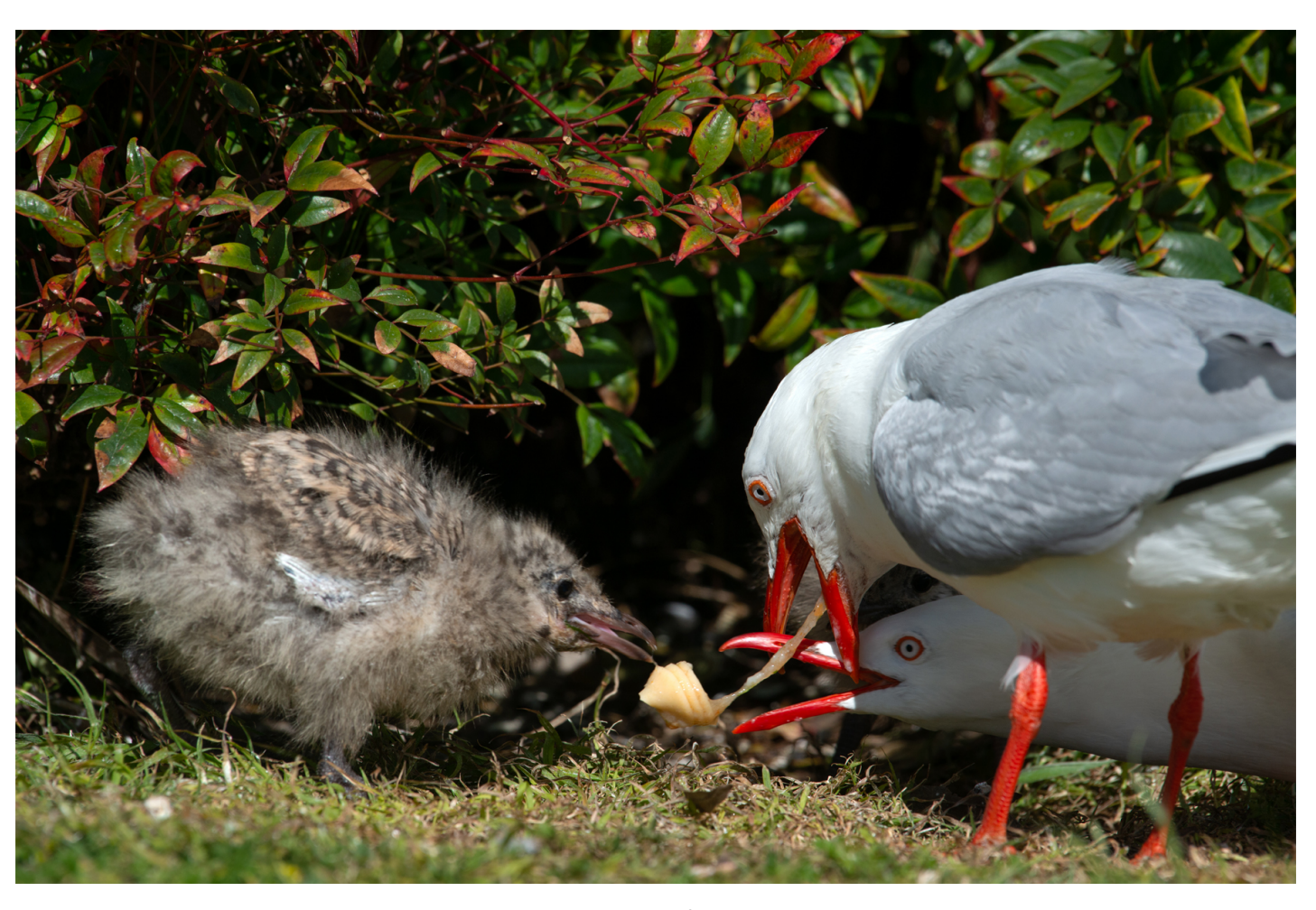
Thief Image of Night (ION) Sylvie Pagna