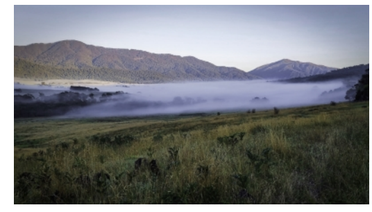
Morning mist Accepted Oliver Dimitrovski