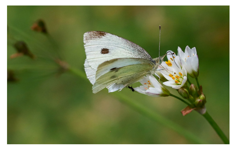
Who is scratching me? Digital Set Subject