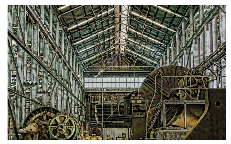
Machinery Shed Cockatoo Island Digital Open