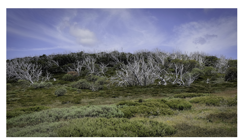
Skytrees Digital Set Subject Credit Oliver Dimitrovski