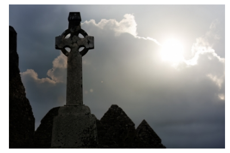
Clonmacnoise Accepted Bernard Graves