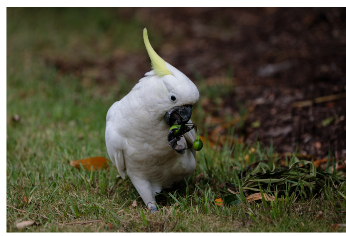
Snack Time Digital Set Subject Credit Ward Kirshaw