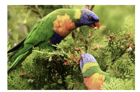
Parroting Accepted Simon Dolle