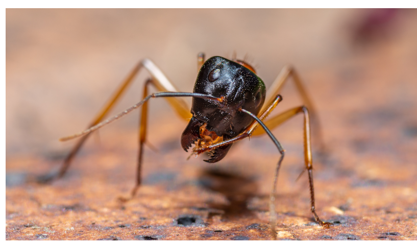
Sugar Ant. A Victims Perspective Digital Set Subject Credit Ted Dimitropoulos