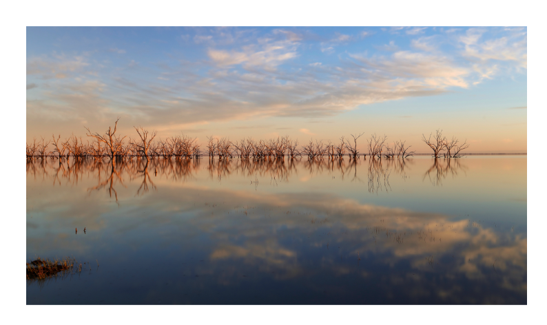
Big Sky Country Digital Set Subject Credit Robert Montgomery