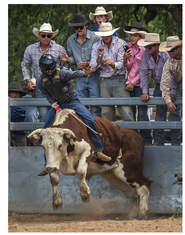
Go Dave 2 Digital Open