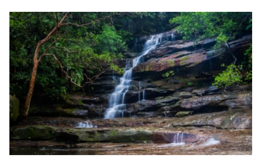
Somersby Falls No3 Accepted Spero Vasil