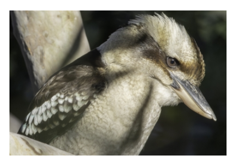
King of the Bush Accepted Simon Dolle