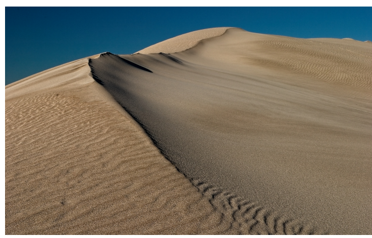
Eucla Sandune Ripples Digital Set Subject