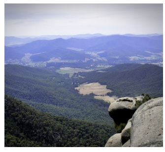
Footprint Accepted Oliver Dimitrovski