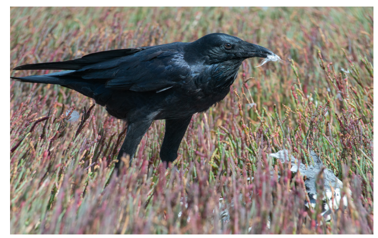
The meal Digital Set Subject Credit Sylvie Pagna