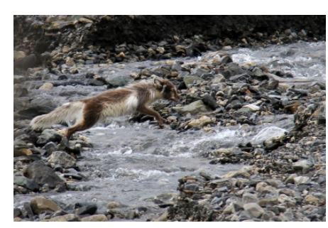
Arctic Fox Accepted Des LYE