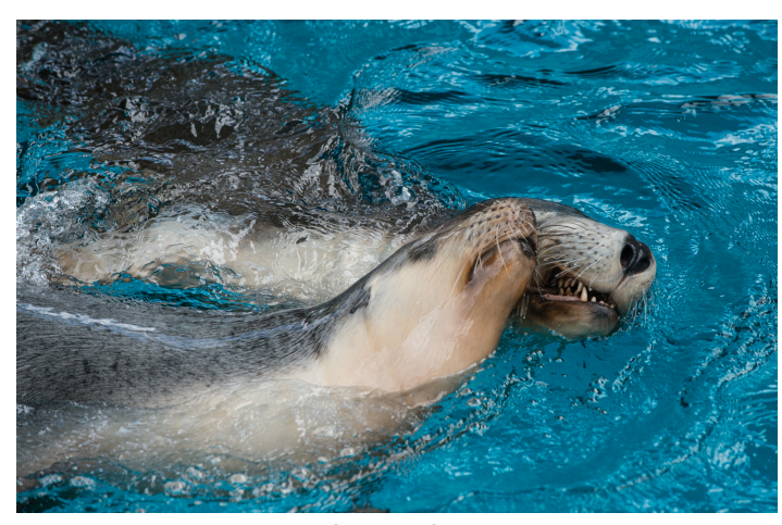
Lets swim Digital Set Subject