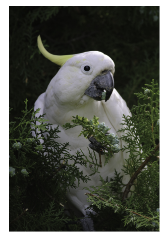
Being Cocky Digital Set Subject Credit Simon Dolle