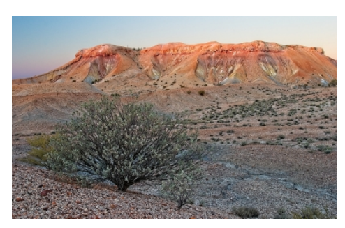
Painted Desert Morning Accepted