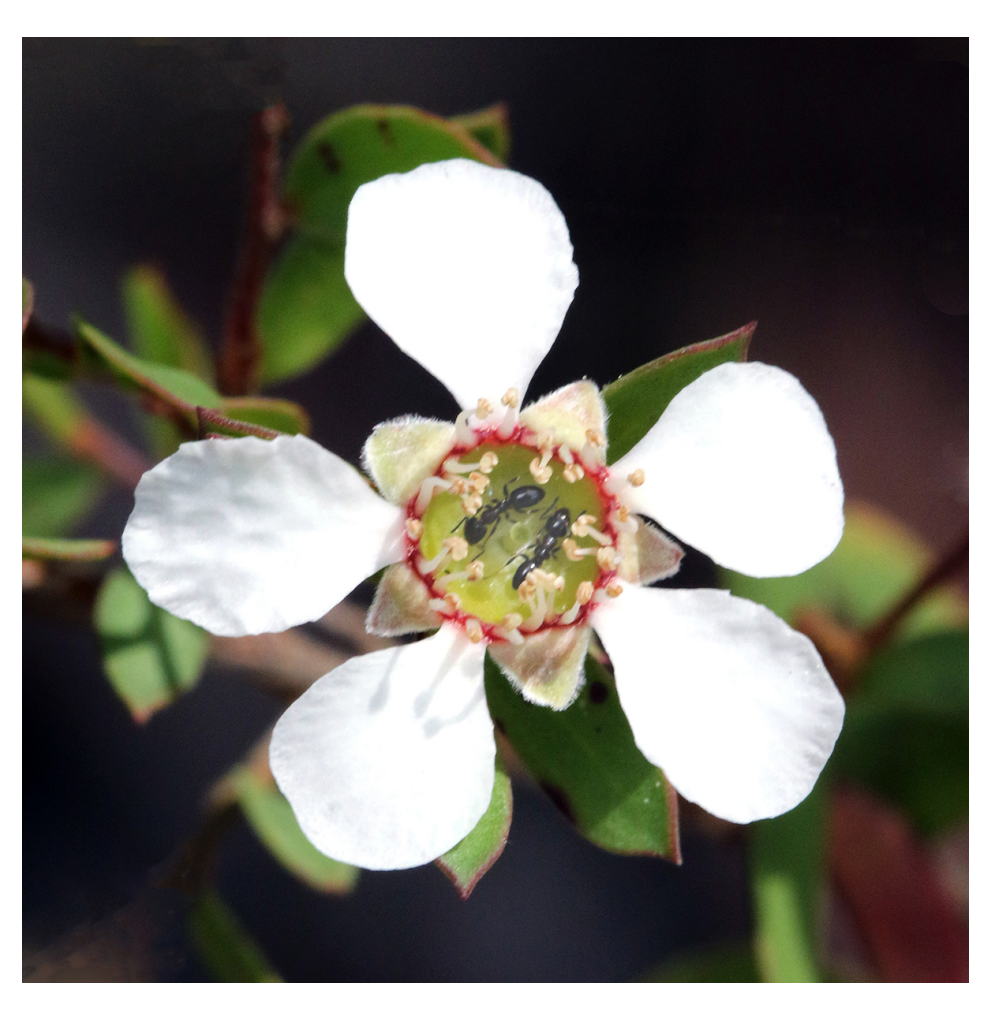
Aust native with ants Print Set Subject Merit Anatoli Zehalko