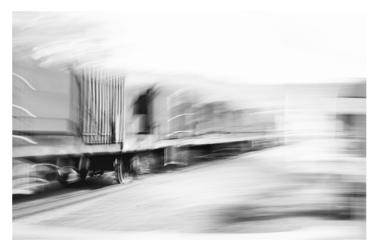
Fast Train Digital Open Credit Bernard Graves